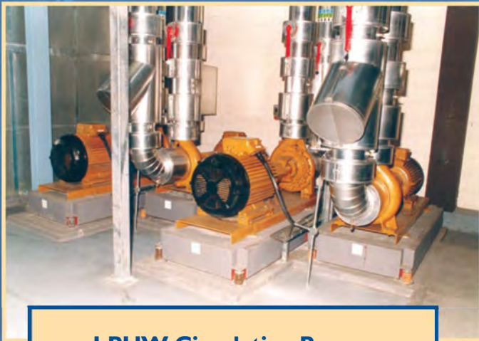
LPHW Circulating Pumps