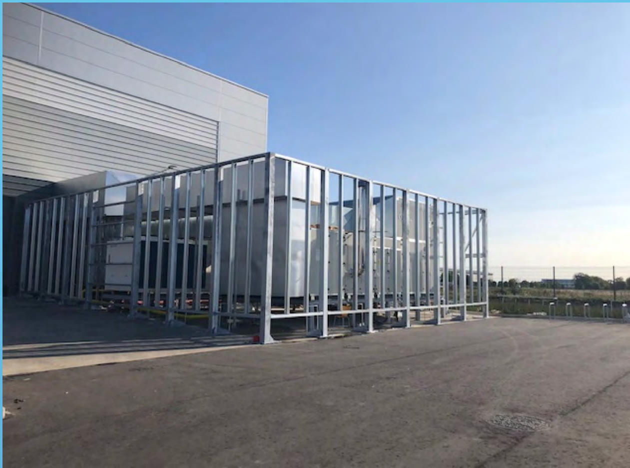
Chiller & AC Plant