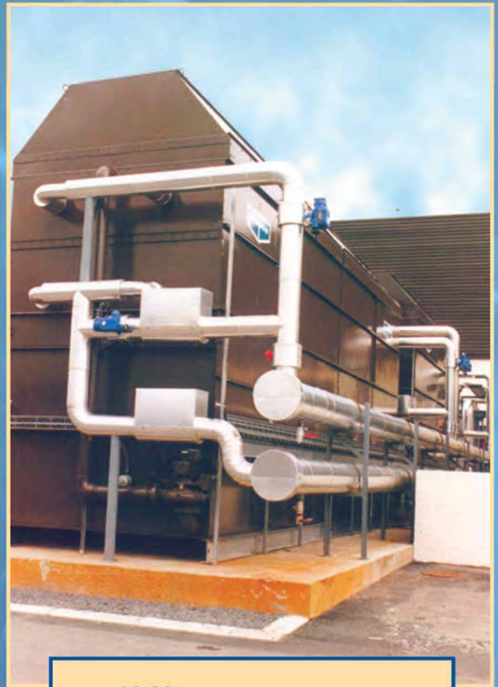
10,000Kw Cooling Towers